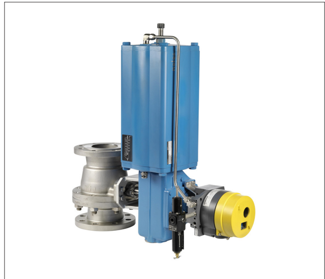
Neles ball valve

Neles ball valves are an optimal choice for HPAL applications. The valves incorporate robust stem-to-ball connection, which assures that the valves are delivering long-lasting performance in isolation and control applications. Application-based seat selection ensures that our valves are capable of delivering tightness even in the most demanding applications, including abrasive fluids and solids handling. Valve modularity widens the options in material selections, to meet the specific requirements of each HPAL process. Our valves meet and exceed modern industry requirements for reliability, performance and safety.